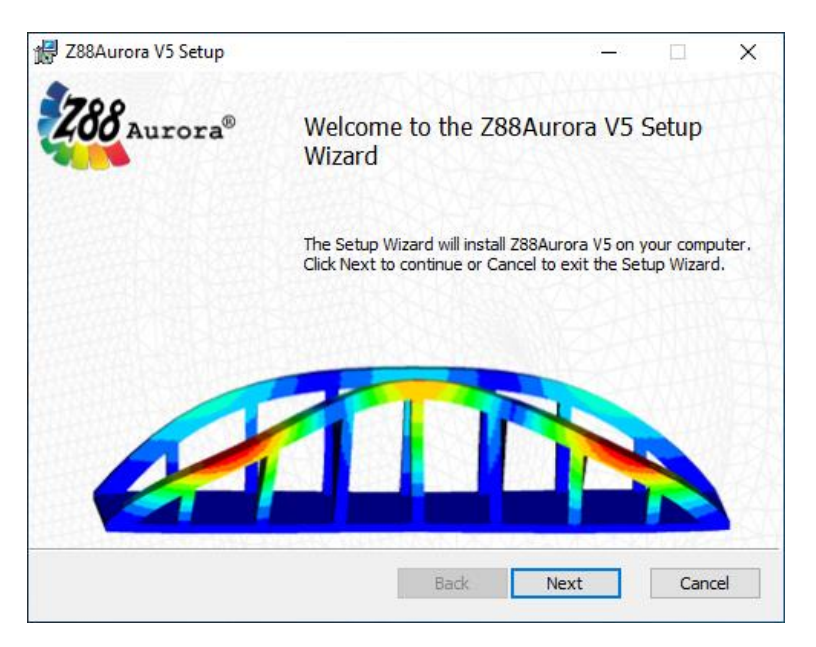
Figure 1: Begin installation with [Next]

Please note that the respective installation directory must not contain any space or special characters!