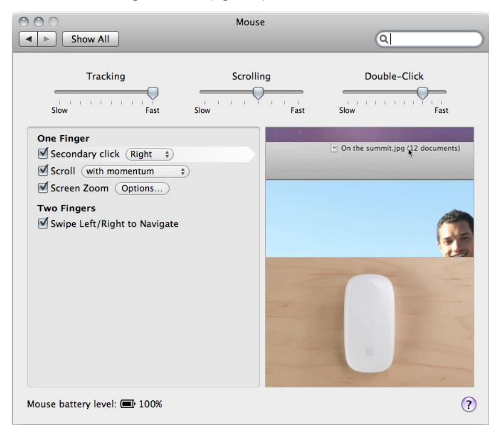
Figure 4: Configuration of Magic Mouse (Screenshot of Mac OS X Snow Leopard)

If you have an Apple Magic Mouse, you can use it for Z88Aurora as well. Use the System Preferences > Mouse –Dialog as follows (figure 4):